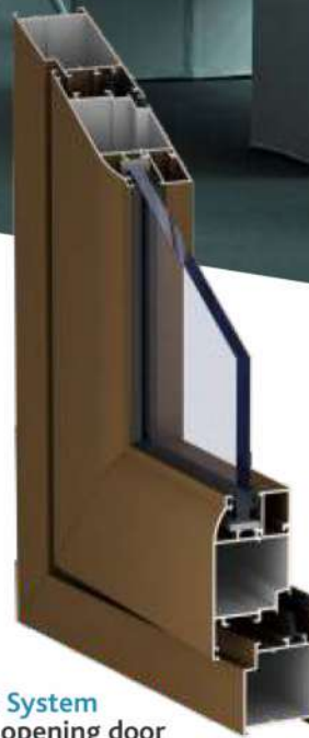
APC 46 System inward opening door