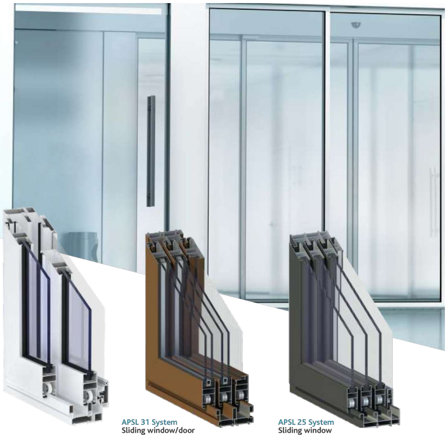
APSL 31 System Sliding window/door