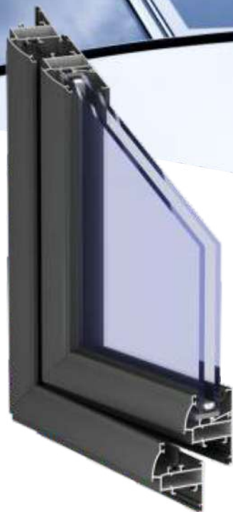
APC 46 System outward opening window