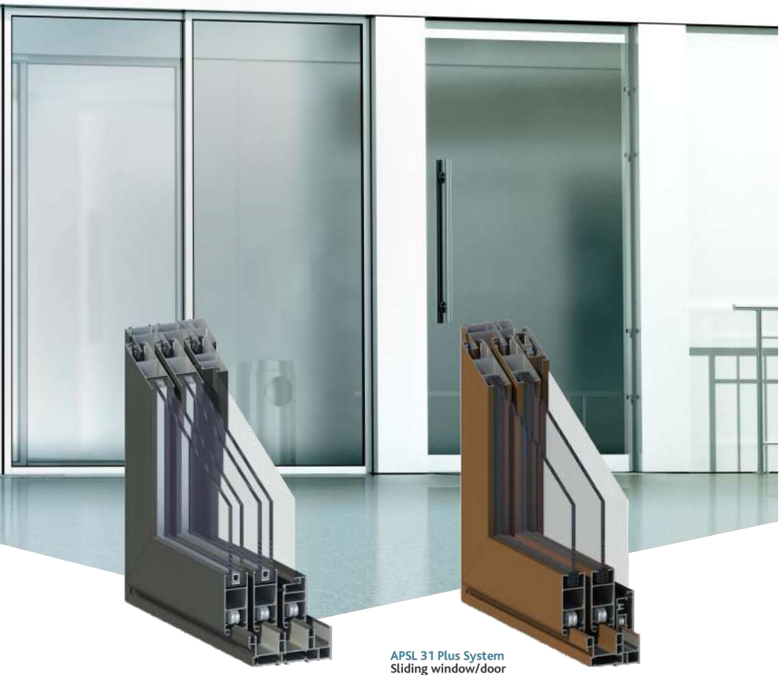
APSL 31 Plus System Sliding window/door

Optionally the sliding units can be equipped with an insect screen, using a special sliding frame. This insect screen offers effective and reliable protection against vermin, mosquitoes, flies and other insects. The stable aluminium frame can also be used as central transom, thus permitting also larger units. The insect screen consists of robust fibre glass tissue with a cover of synthetic material and is extremely tear-resistant and long-lived. The optionally adaptable guiderails integrate the track rollers of the insect screen sliding unit and permit a long-lasting and easy operation. The circumferential brush gaskets allow a secure and complete closure. This way, you can make your home more comfortable, as you can leave the sliding units open without annoying insects coming into your house.