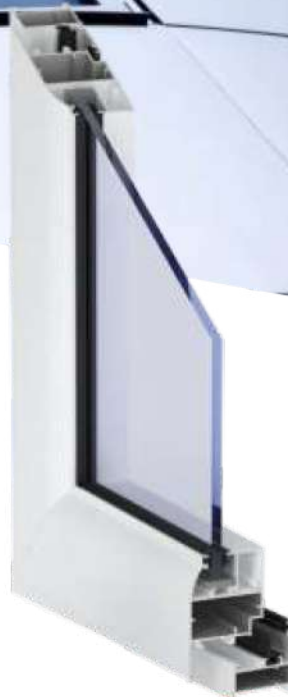
APC 46 System inward opening window