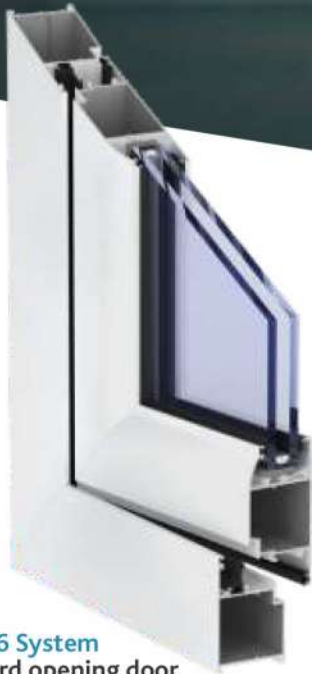
APC 46 System outward opening door