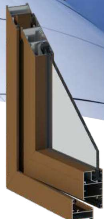
APC 40 System outward opening window